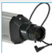
Nextiva IP Cameras