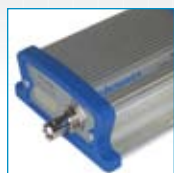
Nextiva Single-Port Encoders and Decoders