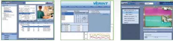
Integration Gateway Screen Detail Examples