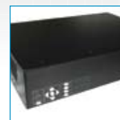
Nextiva Intelligent Mobile and Networked DVRs