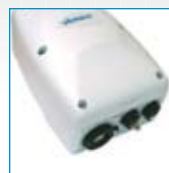
Nextiva Wireless Transmitters, Bridges and Receivers