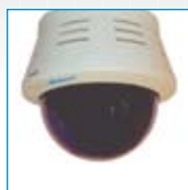
Nextiva IP Mini-Dome Cameras