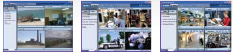
Video Management Screen Detail Examples