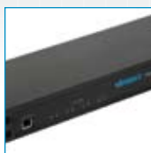
Nextiva Multi-Port Encoders