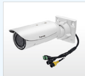
Embedded PoE Extender