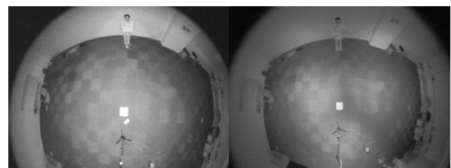
IR with High Uniformity

Combining both H.265 and VIVOTEK Smart Stream II, the camera can reduce bandwidth and storage consumption up to 80% more than cameras using H.264.