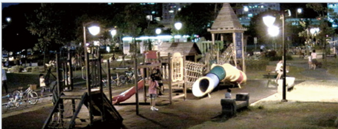
VIVOTEK SNV Camera - Show you true colors at night