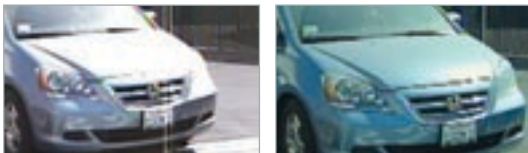
Normal CCD camera