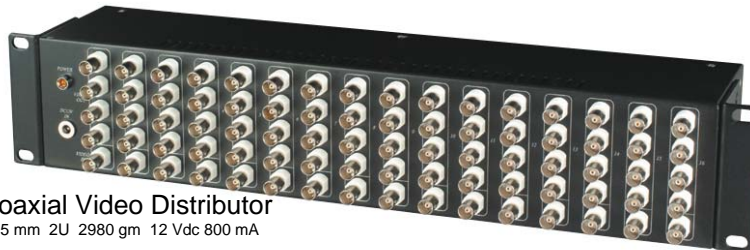
C1664VD 16 in 64 out Coaxial Video Distributor Metal Case 483x110x85 mm 2U 2980 gm 12 Vdc 800 mA