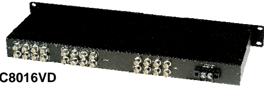
C8016VD 8 in 16 out Coaxial Video Distributor Metal Case 483x195x44 mm 1U 2270 gm 12 Vdc/24 Vac 250 mA