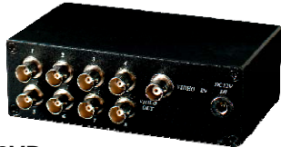
C1008VD 1 in 8 out Coaxial Video Distributor Metal case 133x87x44 mm 450 gm 12Vdc 150 mA