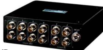
C4008VD 4 in 8 out Coaxial Video Distributor Metal Case 133x145x44 mm 680 gm 12 Vdc 150 mA