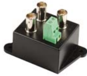
C1002VD 1 in 2 out Coaxial Video Distributor ABS 42x72x46 mm 65 gm 12 Vdc/24 Vac 40 mA

Driving several devices from a single video signal