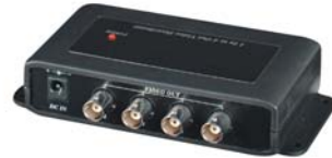
C1004VD 1 in 4 out Coaxial Video Distributor ABS 138x86x30 mm 115 gm 12Vdc/24 Vac 100mA