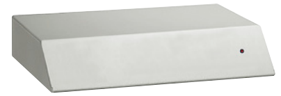
VD48P - VD18T

All units are mounted in a sturdy steel case, painted with epoxy polyester powder.