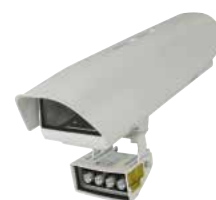
HOV + OSUPPIR + GEKO IRH