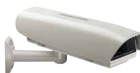
HOV + WBOVA2