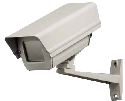
HET + WBCAA

A wide range of accessories is available: sunshield, heater kit and camera power supply in weatherproof box.