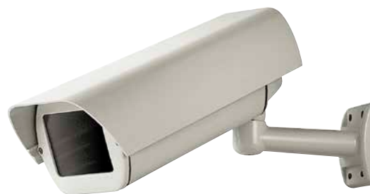
HEB + WBOVA2