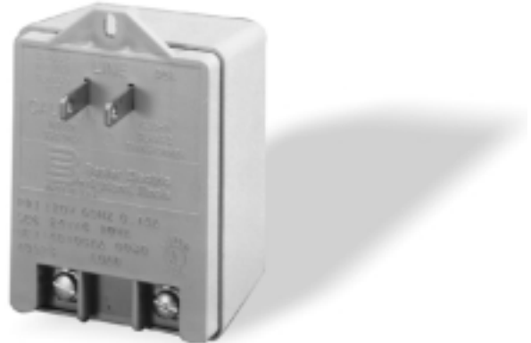
VC24PS-1 POWER SUPPLY