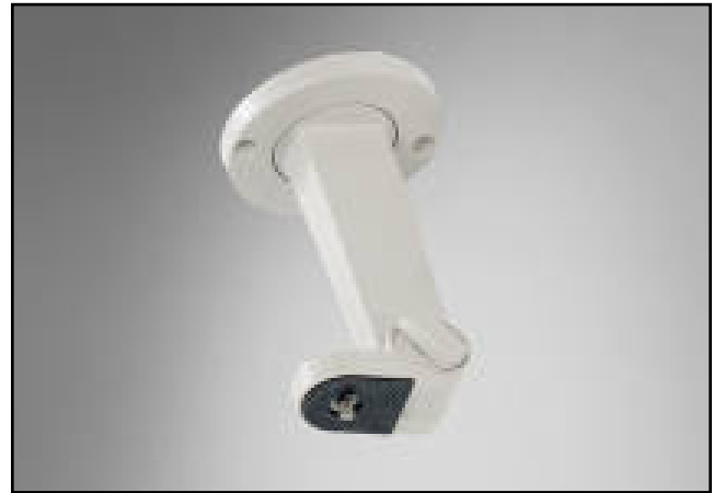
V800ACM CEILING MOUNT