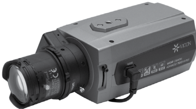
Lens not included