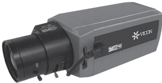
Lens not included