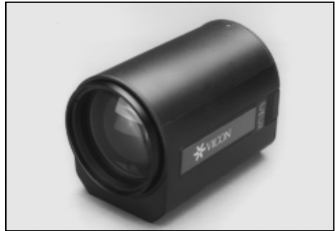
V6-60M-HS-1 MOTORIZED ZOOM LENS