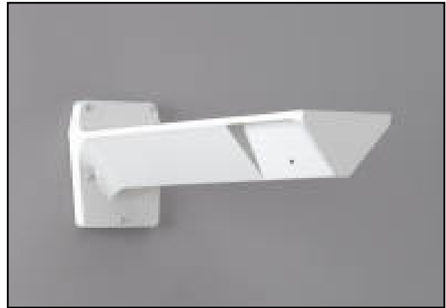
V2000WM WALL MOUNT