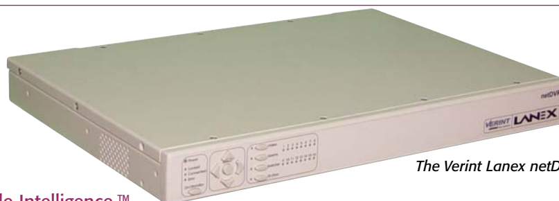
The Verint Lanex netDVR