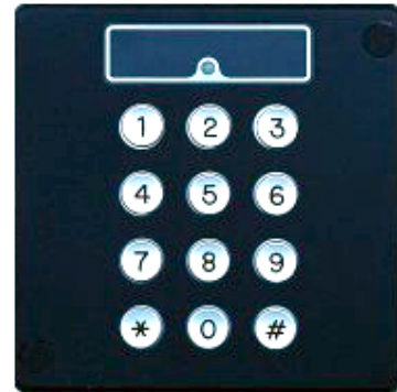
Vandal Proof Keypad

Bi-colour LED's are used to indicate door and access status. VEREX Keypads are available in both Matrix and Wiegand format to ensure compatibility with the widest range of access controllers.