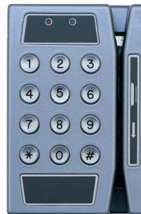
Switchplate MagStripe with Keypad Reader