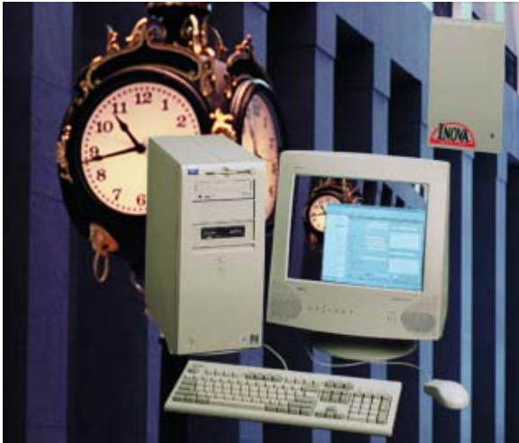
ACCESS CONTROL ADMINISTRATION AND REPORTING SOFTWARE SUITABLE FOR MULTI-DOOR ACCESS CONTROL APPLICATIONS IN COMMERCIAL AND INDUSTRIAL APPLICATIONS