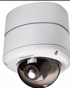
IP module mounted to vandal proof dome camera