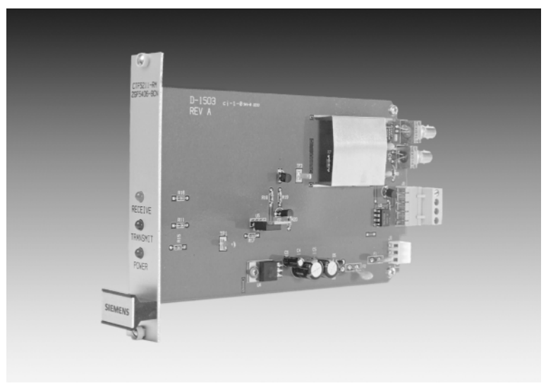
Fibre OpticTransmission System