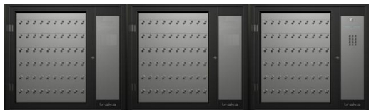
Fig 2. S-Series system with 2 extension cabinets example

Extension cabinets can be connected to the S-Series system allowing up to a maximum of 540 keys to be managed from a single control pod.