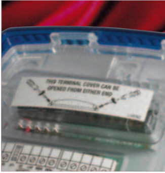
Terminal Block Cover