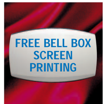
Free Screen Printing Available