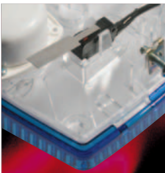
Lid & Wall Tamper