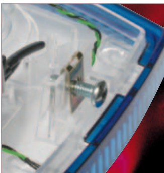
Retained Fixing Screw