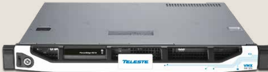
S-VMX Lite is delivered in real estate saving 1U rack server.