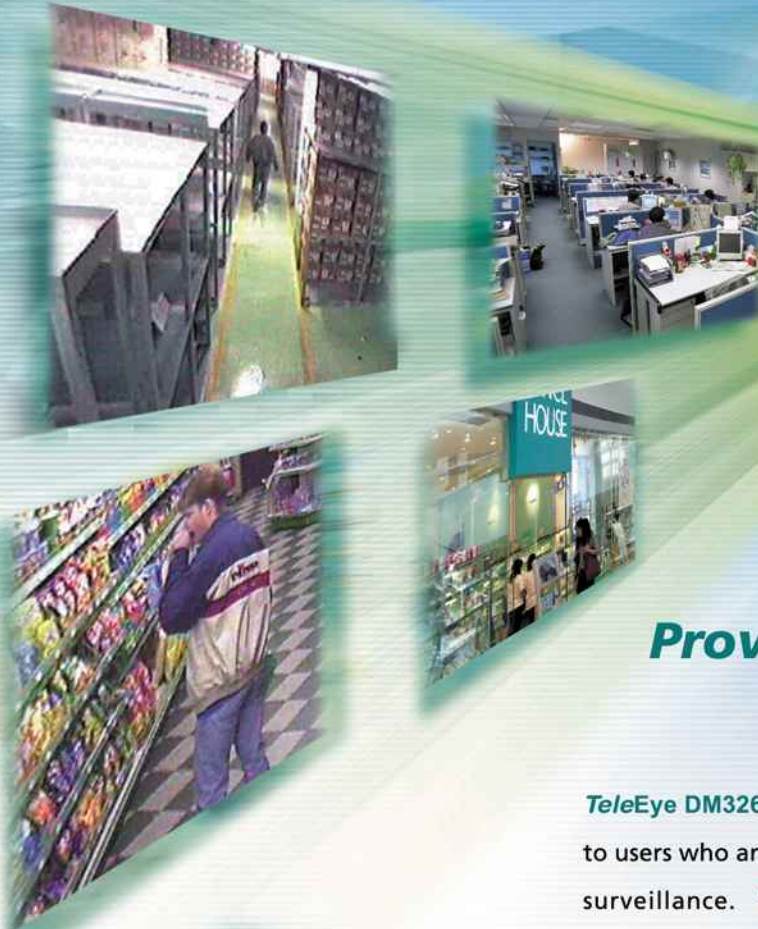
TeleEye III+ Video Transmitter