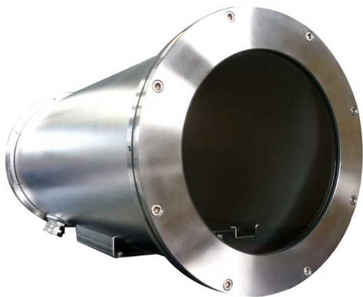
■ 254 Stainless steel camera housing

AISI316L Stainless Steel construction For use in highly corrosive environments Easy installation and maintenance Wiper version available Weatherproof standard IP67 Suitable for very big zoom lenses