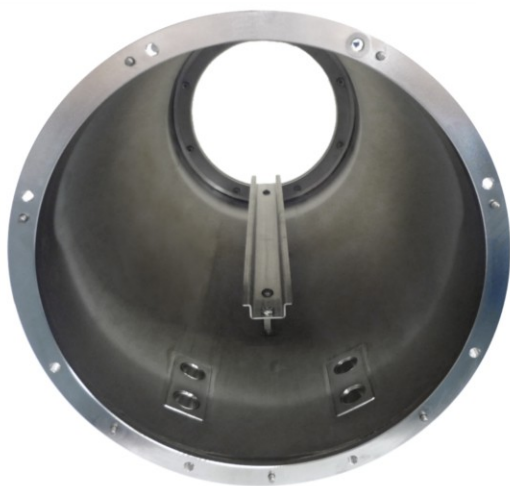
■ 254 Internal view

The housing is made in AISI316L stainless steel, therefore it guarantee absolute reliability and protection in every environmental condition, even the worst. The stainless steel bracket is conceived to reduce vibrations and to keep the housing still in most windy places and for those special applications that require the absence of any vibrations. Install and maintenance tasks are really easy.