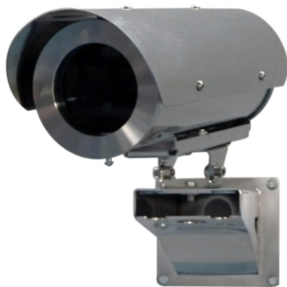
■ 129SH + SSBK129 Housing with sunshield and wall mounting bracket

AISI316L Stainless Steel construction For use in highly corrosive environments Easy installation and maintenance Wiper and washer version available Weatherproof standard IP67 Refined and modern design