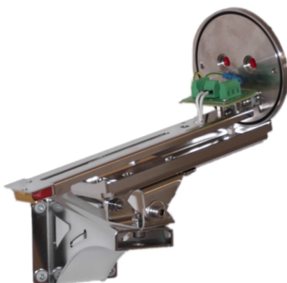
■ 129SH Internal view

■ In outdoor locations, the presence of a corrosive atmosphere can cause rapid deterioration and a premature replacement of the camera and lens if not properly protected. In these areas, a stainless steel camera housing is needed.