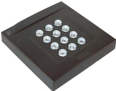
exsmart 2 K MIFARE® reader with keypad