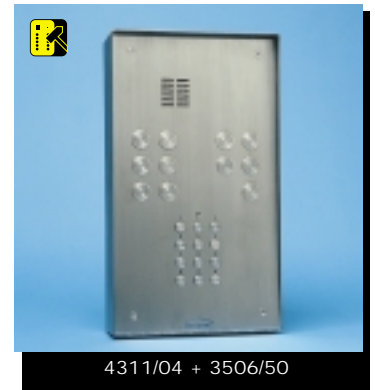
4311/04 + 3506/50