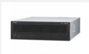
SNT-RS3U Video Network Station rack mount for the SNT-EP154 and SNT-EX154