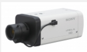
SNC-EB600 Box-type 720p/30 fps Camera Powered by IPELA ENGINE EX™ - E Series