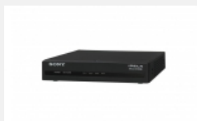
SNCA-ZX104 Hybrid camera receiver allows seamless integration of analogue and IP