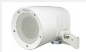
SCA-S30 High quality active outdoor loudspeaker for use with Sony's IP cameras