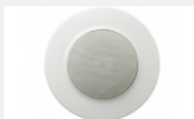
SCA-M30 High quality, ceiling microphone for IP security cameras.