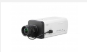
SNC-CH140 Box-type 720p/30 fps Camera - V Series