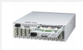
SNTA-RP1 Encoder rack redundant power supply