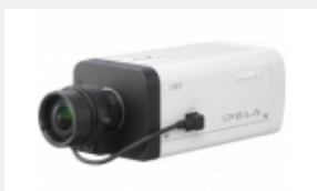
SNC-CH120 Box-type 720p/30 fps Camera - E Series