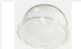
SNCA-CLEAR Replacement clear dome (8")