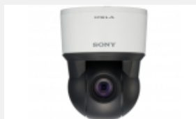
SNC-EP521 Standard Definition (PAL) PTZ Network Camera