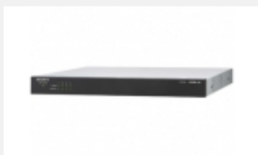
SNT-RS1U Video Network Station rack mount for the SNT-EP154 and SNT-EX154