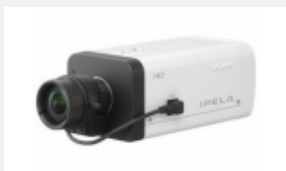
SNC-CH220 Box-type 1080p/30 fps Camera - E Series