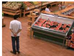
2nd Streaming Cropped area (up to VGA resolution)