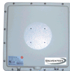
A5 23dBi INTEGRATED (back)