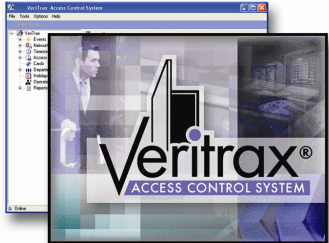
Figure 1: AS-215 Enterprise PC Software

Veritrac™ allows the flexibility of connecting multiple door networks across several communications platforms; RS-485, Ethernet TCP/IP LAN, PSTN Modem.