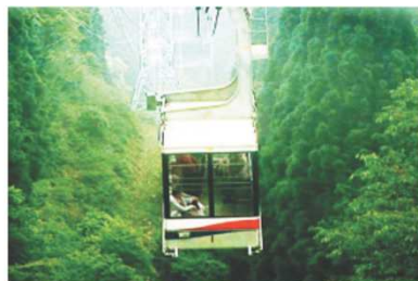
After Fog Reduction