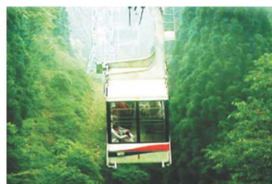
After Fog Reduction