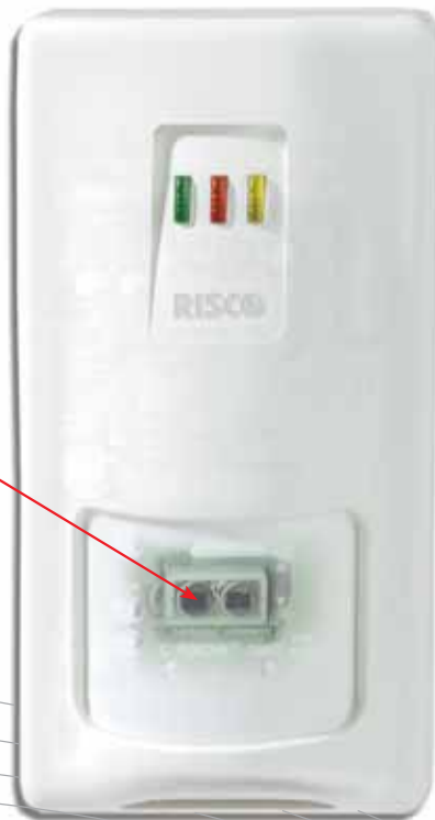
Two dual element PIR sensors

The iWISE ® QUAD AM G3 complies with PD6662, EN 50131-1, TS50131-2-2 Grade 3 requirements and includes built-in EOL resistors for easier installation.