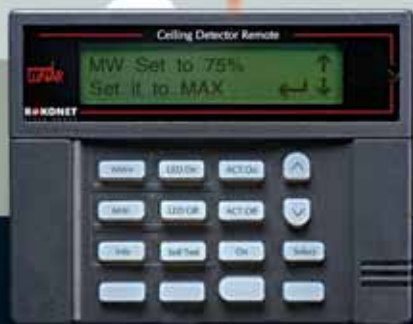
Optional Bi-directional Infrared Remote Control