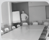
Infra-Red on Internal