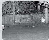
Infra-Red on External