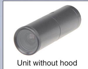
Unit without hood