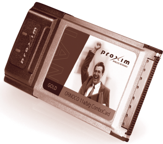
ORiNOCO 11b/g Client Card