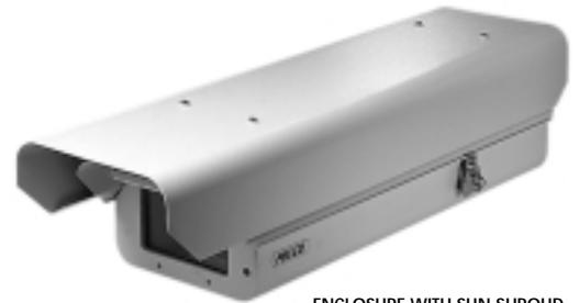
ENCLOSURE WITH SUN SHROUD