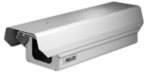
ENCLOSURE WITH SUN SHROUD

The EH4700 Series are indoor/outdoor enclosures constructed from die cast and extruded aluminum. They are available in 18-inch (45.72 cm) ( EH4718 ) or 22-inch (55.88 cm) ( EH4722 ) lengths.