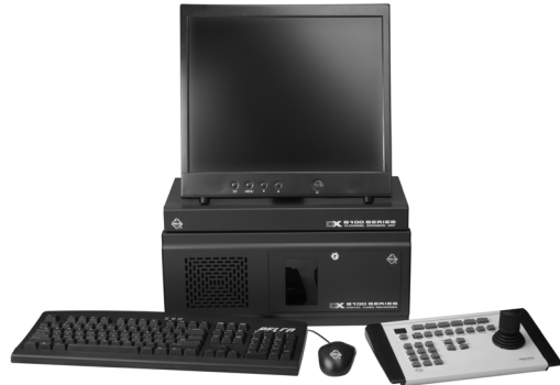
(MONITOR, DX8100-EXP, AND KBD300A KEYBOARD NOT INCLUDED.)

The Choice for Professional Security. As your business becomes more diversified, you need a professional digital video recorder (DVR) that can grow with and stay a step ahead of your security requirements. Your security application might require more cameras or DVR software to provide more sophisticated operation and control features. The DX8100 Series DVRs bring a new and innovative hardware platform powered by unparalleled and unique high performance software.