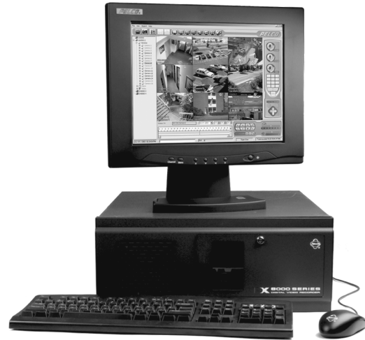
(MONITOR IS NOT SUPPLIED)

The DX8000 Series Digital Video Recorder (DVR) represents the next generation of high-performance, PC-based digital video recorders. It is designed for those users who demand an easy-to-operate, yet innovative DVR. The DX8000 features built-in video motion detection, alarm-based recording, and relay output controls. Models range from an eight-channel, single 80 GB HDD unit to a sixteen-channel unit with up to 1 TB of storage.