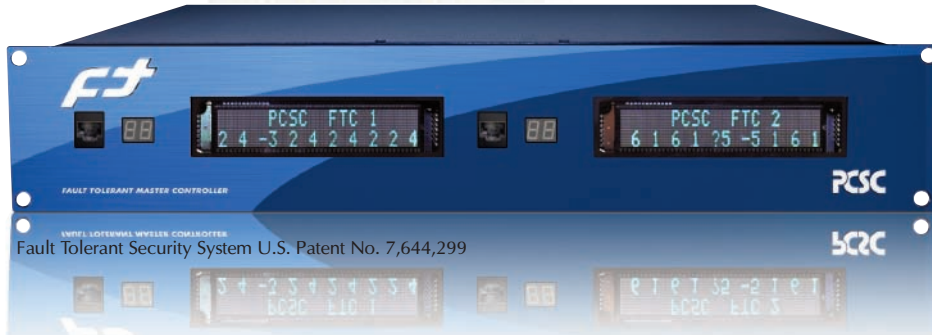
▶ Dual Fault Tolerant Controllers configured with optional 19" 2U rackmount enclosure and optional dual vacuum fluorescent displays

PCSC offers the world's first Fault Tolerant (FT) controller series creating the highest level of reliability with its automated process of system recovery for access control, alarm monitoring and output control systems. The FT Architecture (FTA) is the next evolution of building security management designed with a Virtual Point Definition network, integrated peer-to-peer and redundant communications. The FT system is designed to automatically recover regardless of communication or controller failure.