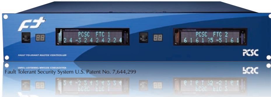
▶ Dual Fault Tolerant Controllers configured with optional 19" 2U rackmount enclosure and optional dual vacuum fluorescent displays

PCSC offers the world's first Fault Tolerant (FT) controller series creating the highest level of reliability with its automated process of system recovery for access control, alarm monitoring and output control systems. The FT Architecture (FTA) is the next evolution of building security management designed with a Virtual Point Definition network, integrated peer-to-peer and redundant communications. The FT system is designed to automatically recover regardless of communication or controller failure.