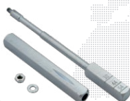
PaxLock Split spindle - 8mm