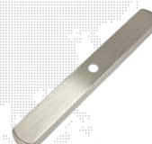
Net2 PaxLock blank inner handle cover - Pack of 5