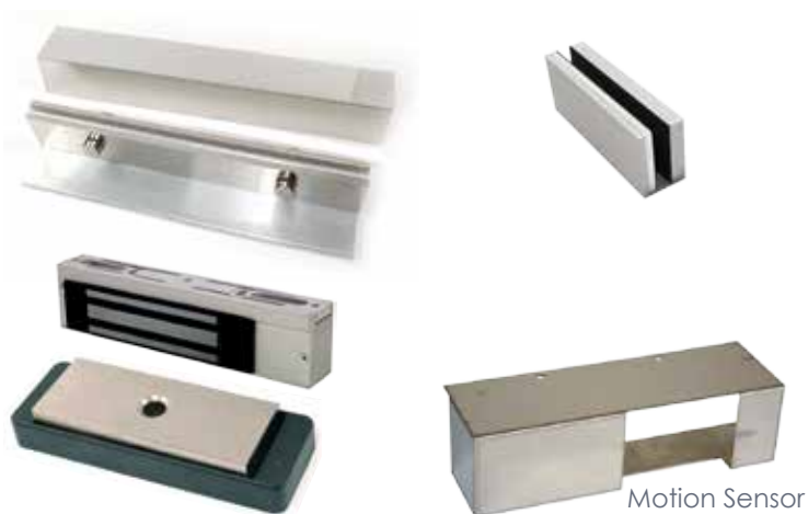
Motion Sensor Bracket