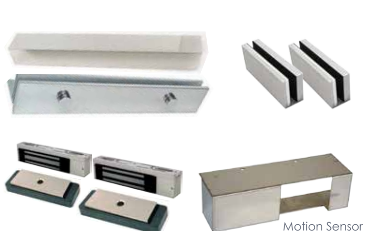
Motion Sensor Bracket