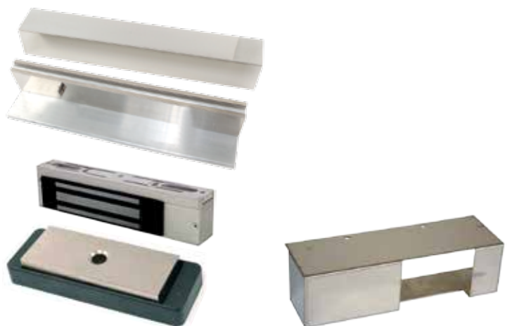
Motion Sensor Bracket