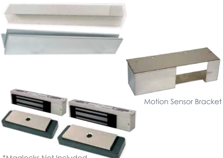
Motion Sensor Bracket