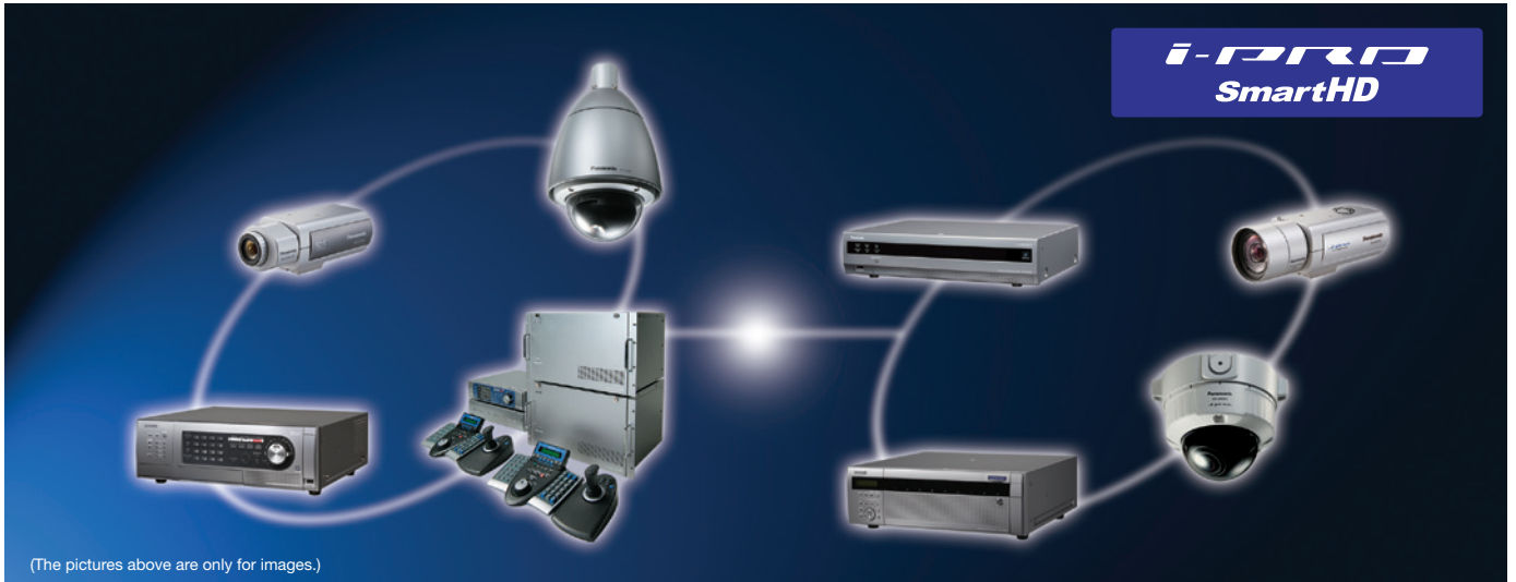
(The pictures above are only for images.)