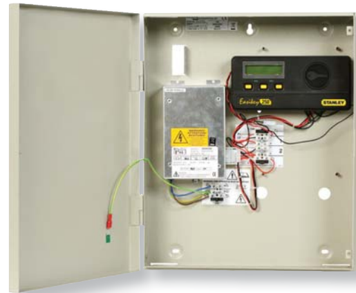
Easikey 250 boxed without cut-out