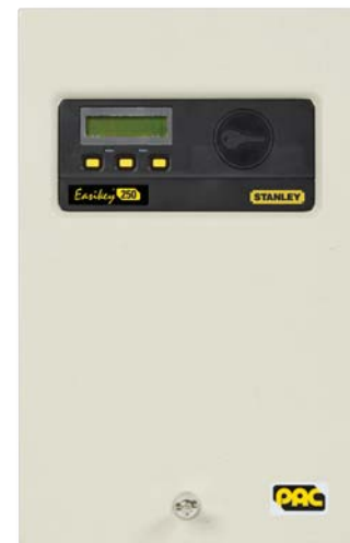
Easikey 250 boxed with cut-out