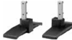
Optional Stand: ST-322V